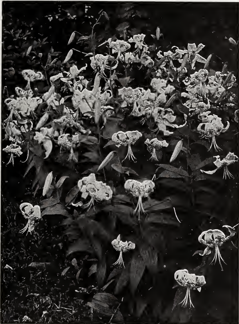
Lilium speciosum magnificum